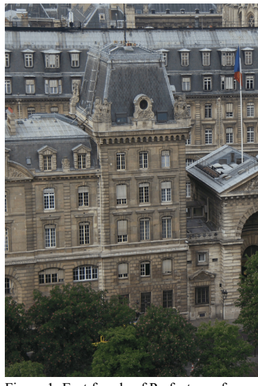
Figure 1: East facade of Prefecture of Police seen from the Notre Dam Cathedral, Paris.

There are four major types of heat-related illnesses: heat rash, or prickly heat; heat cramps; heat exhaustion; and heat stroke. Heat exhaustion is a warning of more serious things to come. Progression to heat stroke may occur without treatment. Heat stroke is a life-threatening medical emergency that requires hospital treatment.